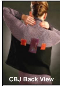
CBJ Back View